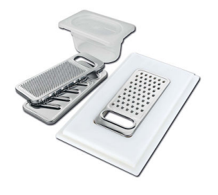
Graters kit with ring-holder and food collection tray

8159 101 * only in combination with the accessory 8644 101